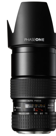
75-150mm AF f/4

The versatility of this lens makes it a preferred choice for location photographers, securing great image quality at all focal lengths.