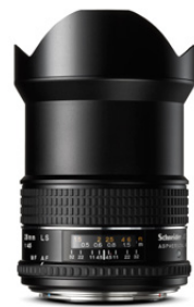
28mm LS f/4.5

Provides complete coverage of full-frame medium format, and provides the fastest flash synchronization capabilities.