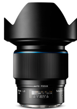
35mm LS f/3.5

The professional choice for wide-angle, providing quality in both flash and daylight shooting.