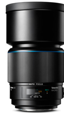
120mm LS f/4.0 Macro

Ideal for close-up product shots, and equally ideal for close up beauty, action, nature and wildlife photography.