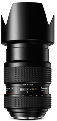
75-150mm LS f/4.0

This lens provides flash sync up to 1/1600s and the freedom to compose your framing.