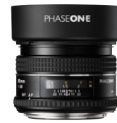
80mm AF f/2.8

A great all-purpose lens, exhibiting outstanding optical performance. All scenes are captured with amazing detail and accuracy.