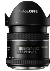
45mm AF f/2.8

Using low dispersion glass, this wide-angle lens offers minimal chromatic aberration and is ideal for high contrast conditions.