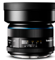
80mm LS f/2.8

A preferred choice for location fashion photographers using fill flash and an essential lens for every photographers kit.