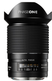
28mm AF f/4.5

A Superb, extreme wide-angle lens for full format digital. Perfect for landscape, architecture and creative control.