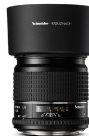
110mm LS f/2.8

A longer focal length with just enough optical compression for full-length fashion, beauty and portraiture.