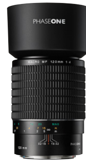
120mm MF f/4 Macro

For beauty, portrait and close-up macro work, this lens will deliver amazing results.