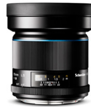
55mm LS f/2.8

Minimal distortion semi-wide-angle design provides a normal look, great for editorial portraits and lifestyle photography.