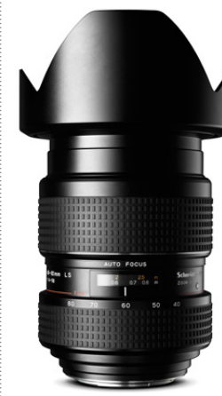
40-80mm LS f/4.0

Ultra sharp rendition on all focal lengths. The optical quality of this zoom lens is comparable with what you would expect from a genuine prime lens.