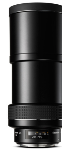
240mm LS f/4.5

Ideal lens for getting close to your subject while maintaining your distance, whether you're shooting beauty, sports, landscape or wildlife.