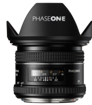
35mm AF f/3.5

A compact and lightweight wide-angle. Ideally suited for street, landscape, interior or architecture photography.