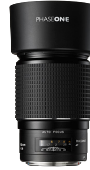
150mm AF f/2.8

To enhance operation for wedding and portraits, this lens offers fast internal focusing for easy use with special effect filters and vignettes.