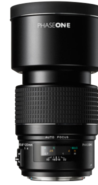
120mm AF f/4 Macro

The 120mm AF Macro lens is staggeringly sharp and ideal for beauty, portraits and close-up macro work this lens delivers amazing results in all fine detail applications.