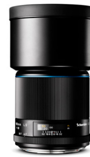
150mm LS f/3.5

A standard portrait lens with applications in fashion, beauty, lifestyle and sports.