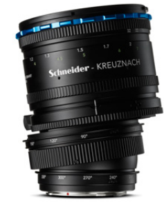
120mm TS f/5.6

Perfect for studio work, product shots and for creating stunning images using an offset focus plane. 8° tilt, 12mm shift, rotating lens groups 360° on both axes.